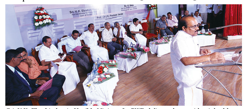
Sri. V.K. Ebrahimkunju Hon'ble Minister for PWD delivers the presidential address.

The School of Management Studies was established in 1964 and gained reputation as one among the top 5 B-schools in India for decades. Its alumni decorate prestigious positions in various corporate as well as government organizations.