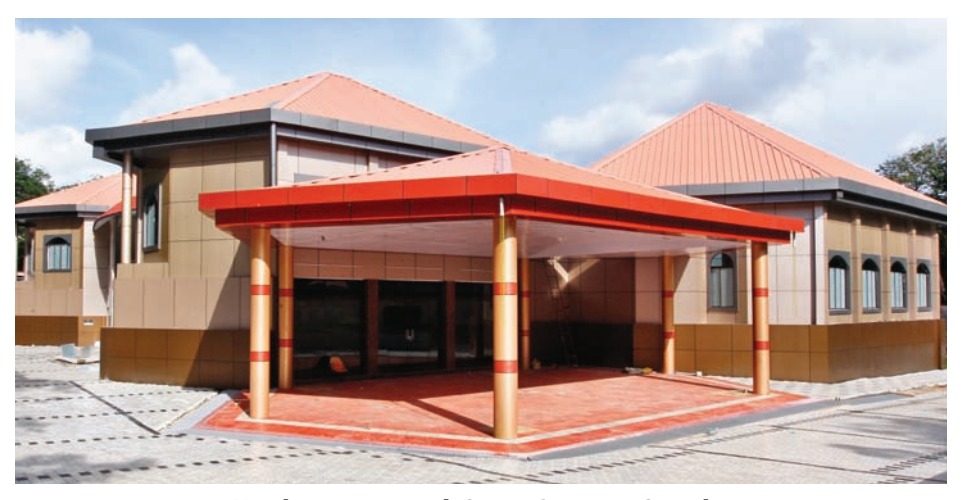
Newly inaugurated Cusat Seminar Complex

theatre effect. The reception hall, separate dining area and all other rooms have been provided with the most advanced sanitary and other fittings. The first floor incorporates two office rooms, Executive Hall & Conference Hall that can accommodate 80 persons and toilets. The Seminar Complex occupies a total area of 32024