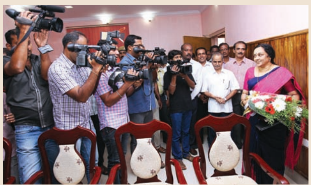
A friendly meeting with the media fraternity