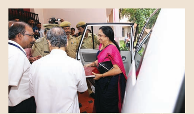
Hearty welcome to the Hon'ble Vice Chancellor