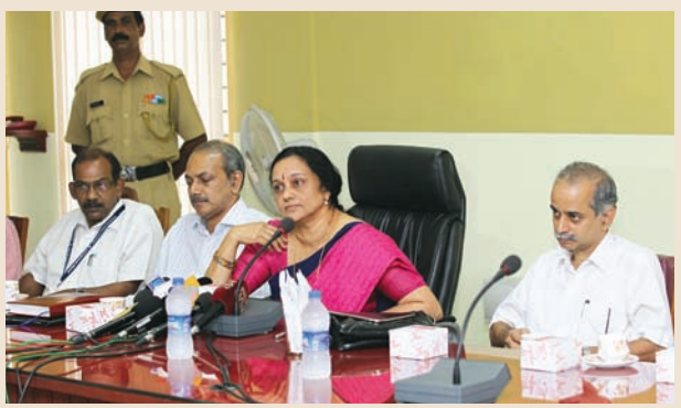
Interactive session in progress