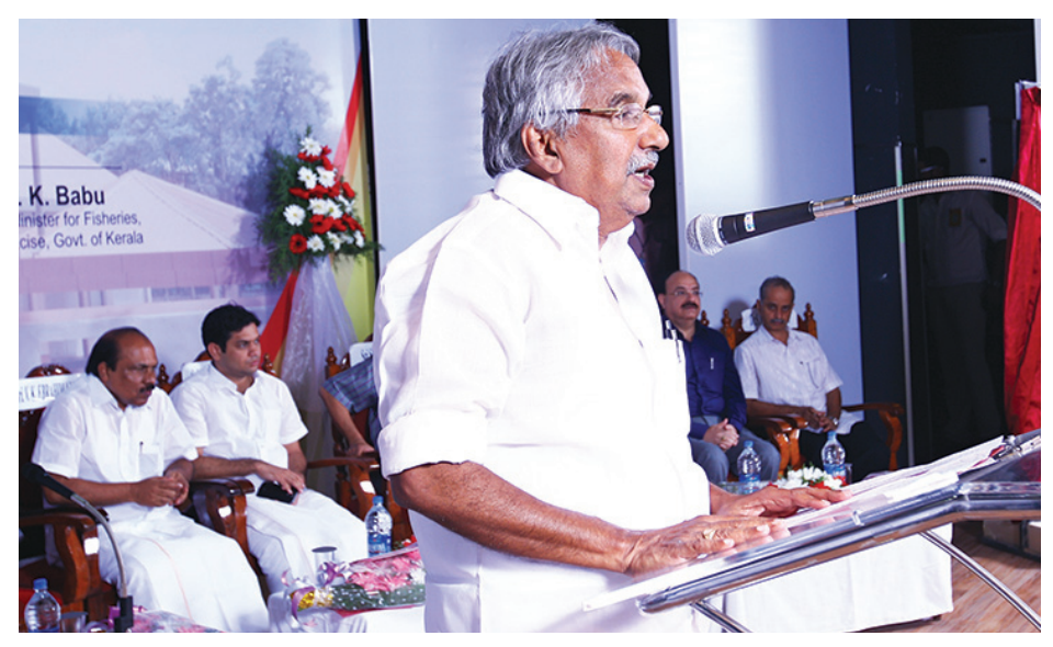
Sri. Oommen Chandy, Hon'ble Chief Minister of Kerala delivering the inaugural speech at the Cusat Seminar Complex.

The ultra-modern Science Seminar Complex, constructed under the supervision of Cusat Engineering Department. having two air-conditioned halls can seat a total of 750 participants and was built at a cost of Rs. 6 cr.It has all facilities to host National and International Seminars. The Main hall has an area of 6639 sq. ft. and a raised stage/platform of 1116 sq.ft. The Mini Seminar hall can seat 75 persons comfortably. Equipped with the latest technology in acoustics and scientific seating arrangements, the halls provide a