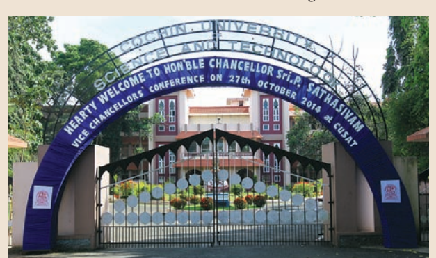
Arch-gate installed in front of the Admn. Office of Cusat to welcome the Hon'ble Chancellor